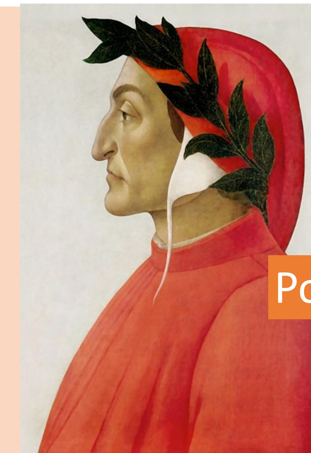
Portrait of Dante