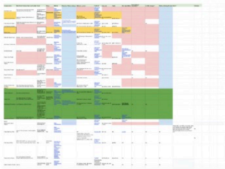
This is the Google Spreadsheet used with all the company information.

This project is a culmination of theatre programs and companies in both the direct and greater Tallahassee area. It is created in the form of a digital library and contains both a theatre index and a calendar. The theatre index lists all of the companies in forms of profiles, each containing the same formatting. The information included in this format are the company's social media sites and a summary of what the company does. The calendar is an extension of the profile's information, for it lists any upcoming events for the companies included in the index. This is all found on a Wix website and was created for simple and direct access to the arts in Tallahassee. Through this index, we are hoping to incorporate more theatre in the area and allow for more direct communication between companies, thus enhancing a positive theatre morale in the city. If theatre companies are able to be in contact with one another, it is with hope that more cohesive projects can be created and initiatives in which societal issues are focused on can be developed. This will change the impact of theatre and showcase that there is more to the arts than one can simply perceive.