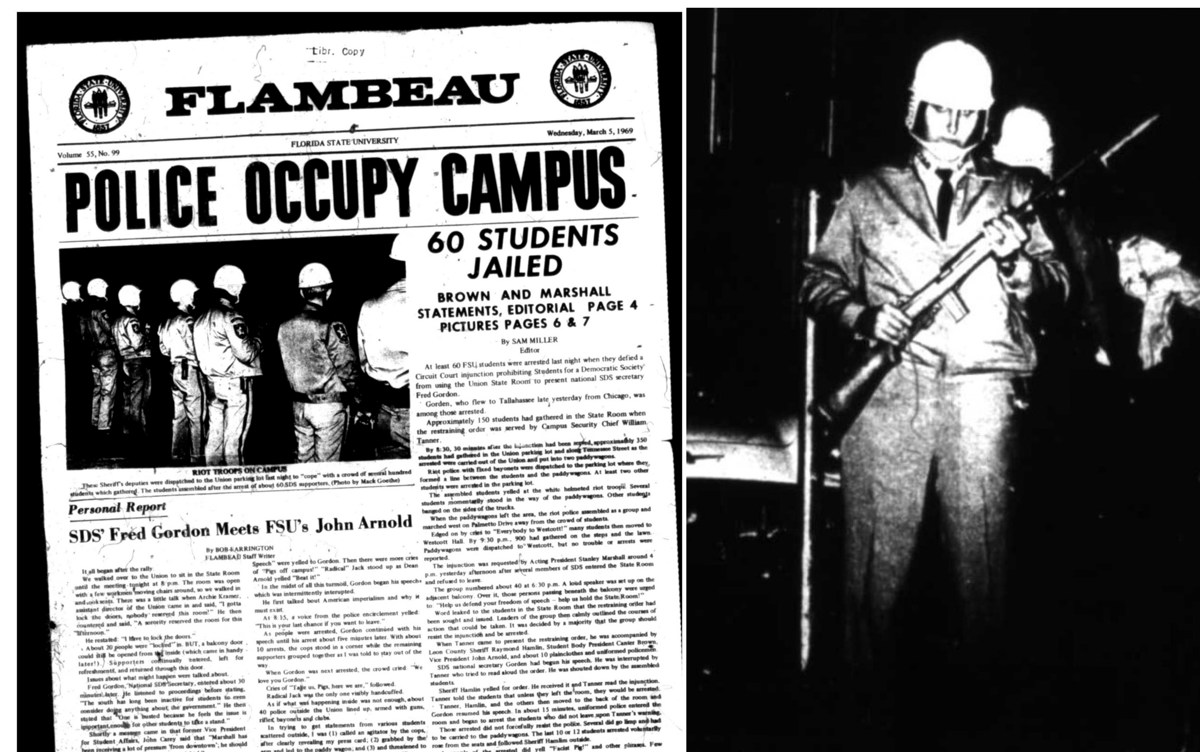
Figure 3: Capture of FSU's Flambeau, a student-led university publication, detailing FSU's "Night of the Bayonets" in which 60 students were jailed for participating in an "unlawful" SDS meeting.