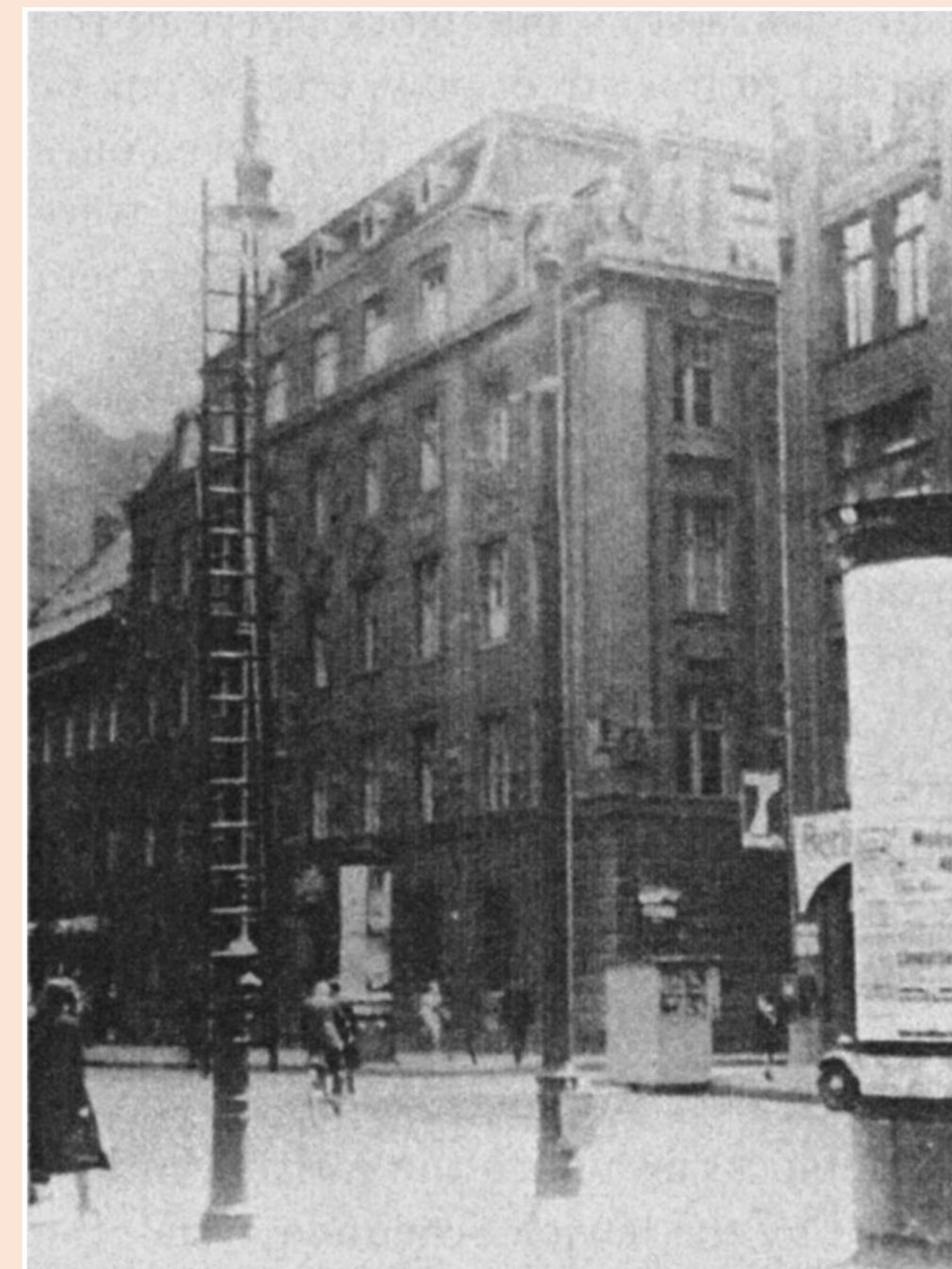
Figure 1: The Rosenstrasse Center, the site where Jewish men were detained from February to March 1943.

Through our research we found thirteen birth, death, and marriage records and certificates of the women who were part of the protest. Twelve phone book records were found which indicated the location of the protestors before, during, and after the war. Moreover, eight immigration records suggested similar information. Finally, when identified, the living descendants of the women who were part of the protest were contacted for further information.