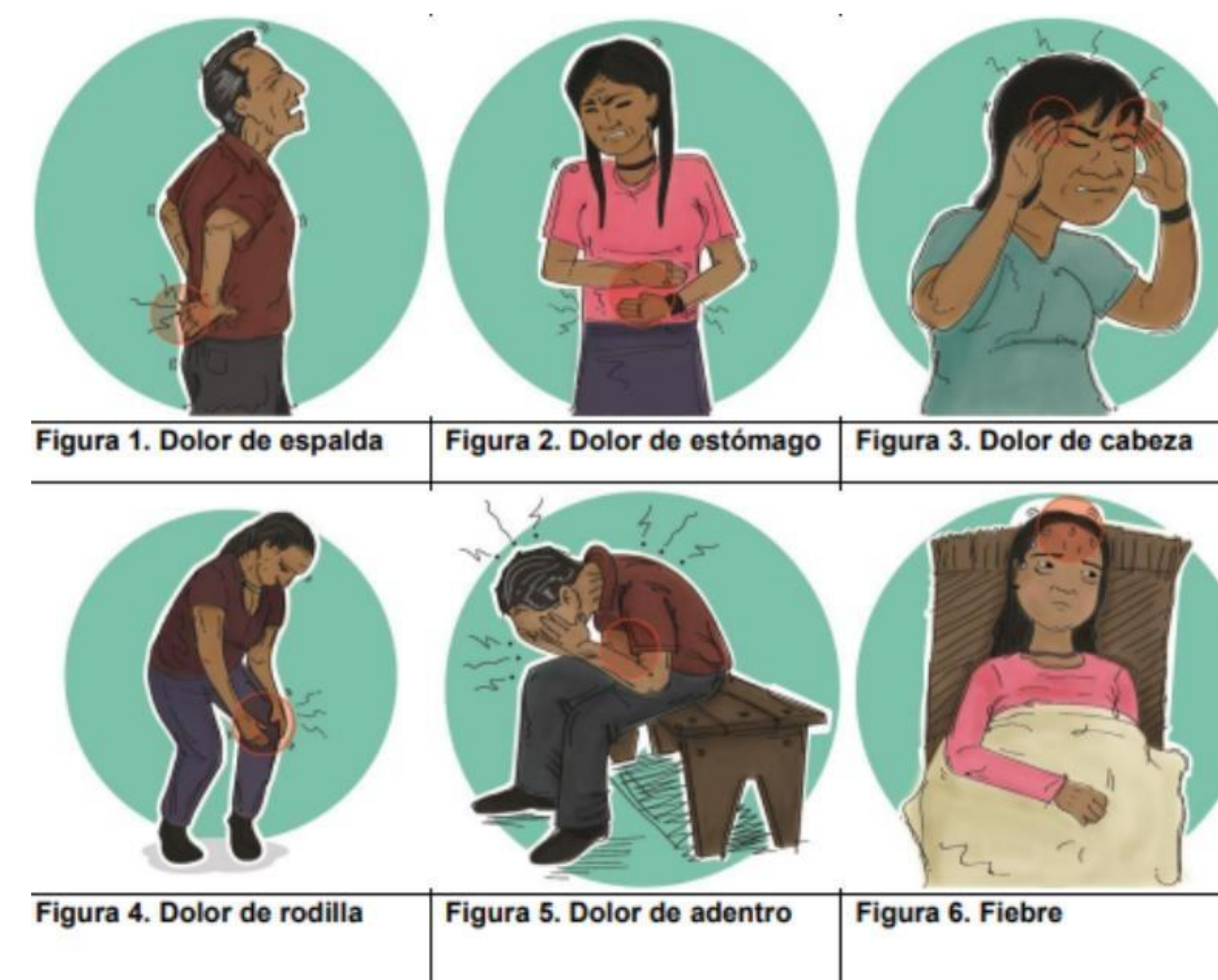
Figure 3: Showcases pictograms that will be used to help communicate symptoms felt by patients.