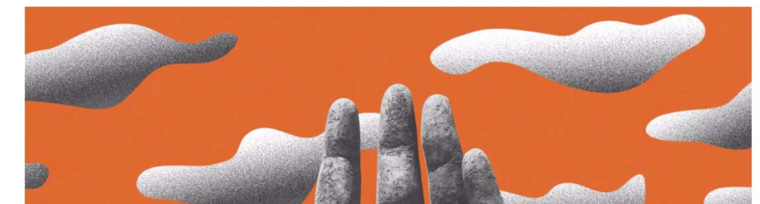
This is the Montage logo and front page of the website.