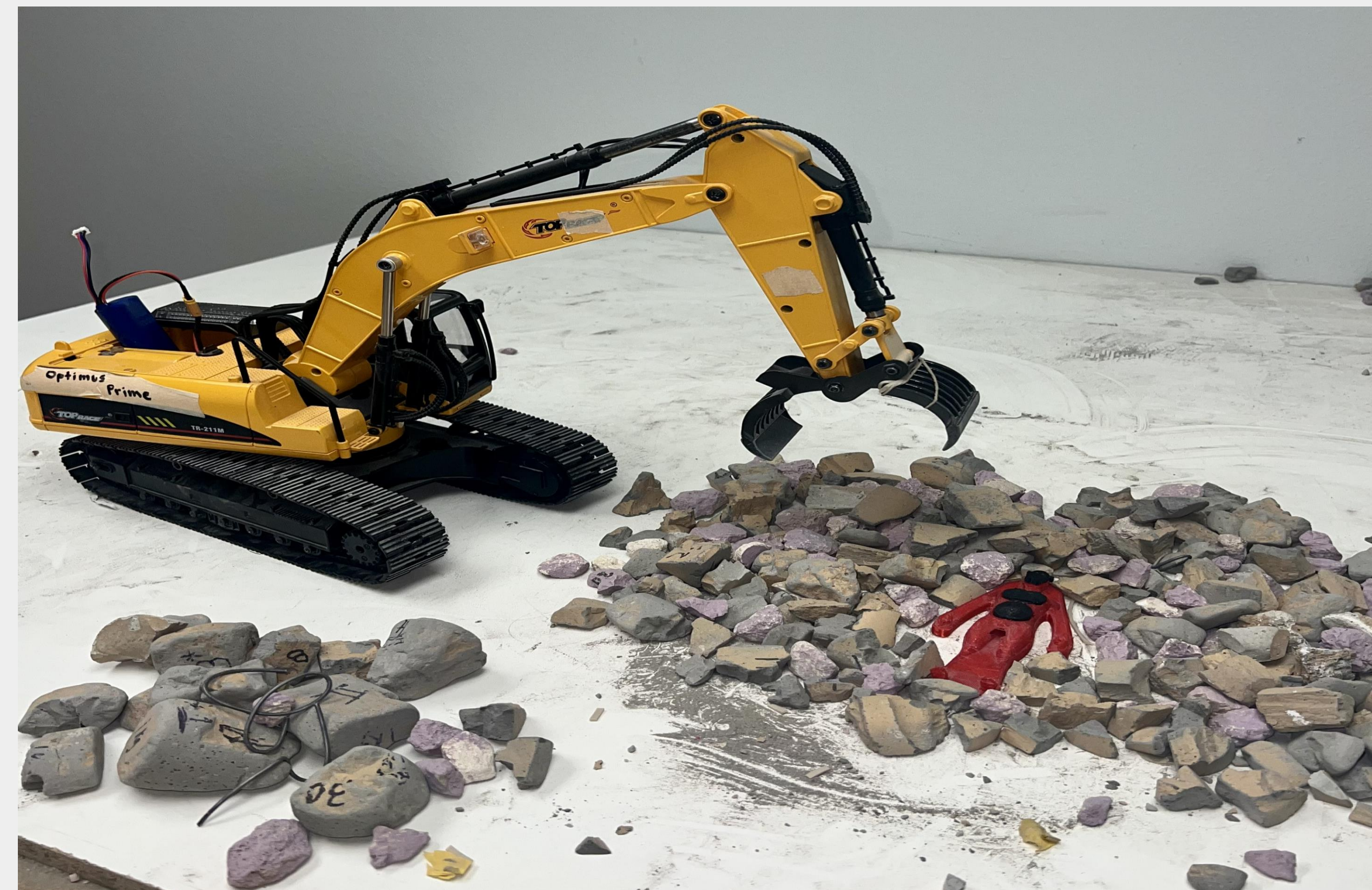
Fig. 1 Simulating rescue operations using small-scale heavy equipment