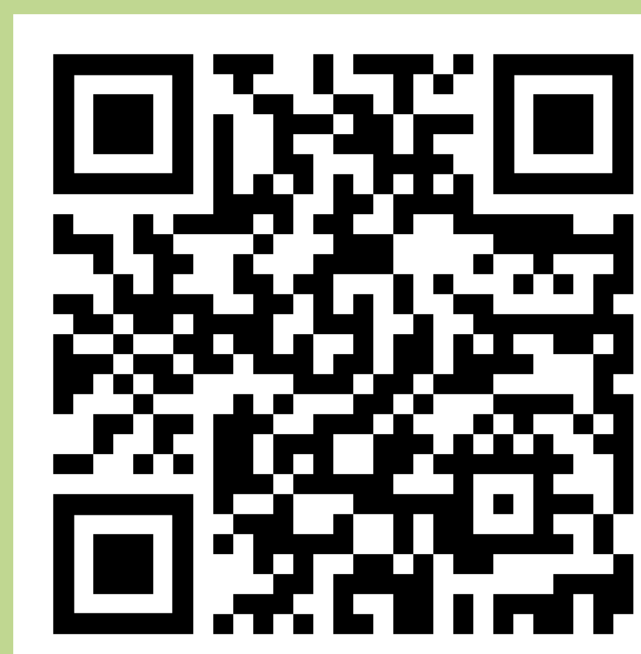
Figure 2: QR Code for the Blackivate Joy CreateFSU website created under the Pen & Inc. Program.