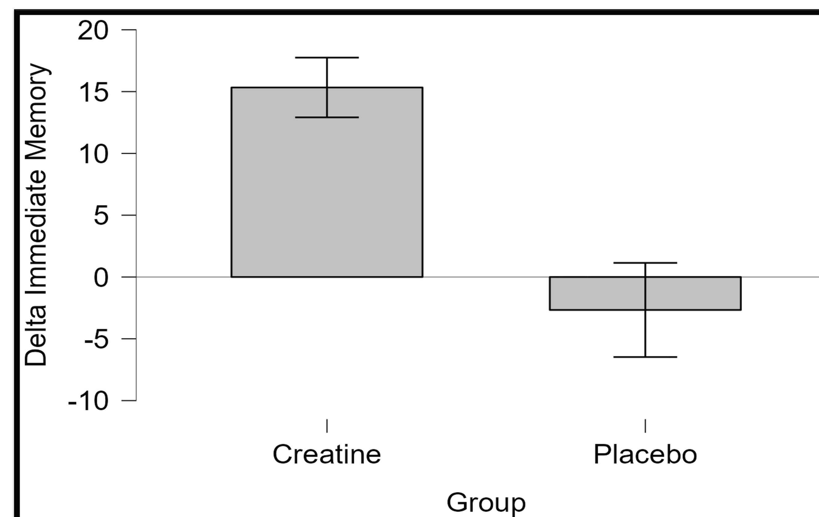
Figure 1: Delta Change in RBAN scores for Immediate memory in creatine and placebo groups (CM = 15.33 ± 2.42, PL = -2.67 ± 3.81, t(10) = 3.99 , p = 0.003 ).