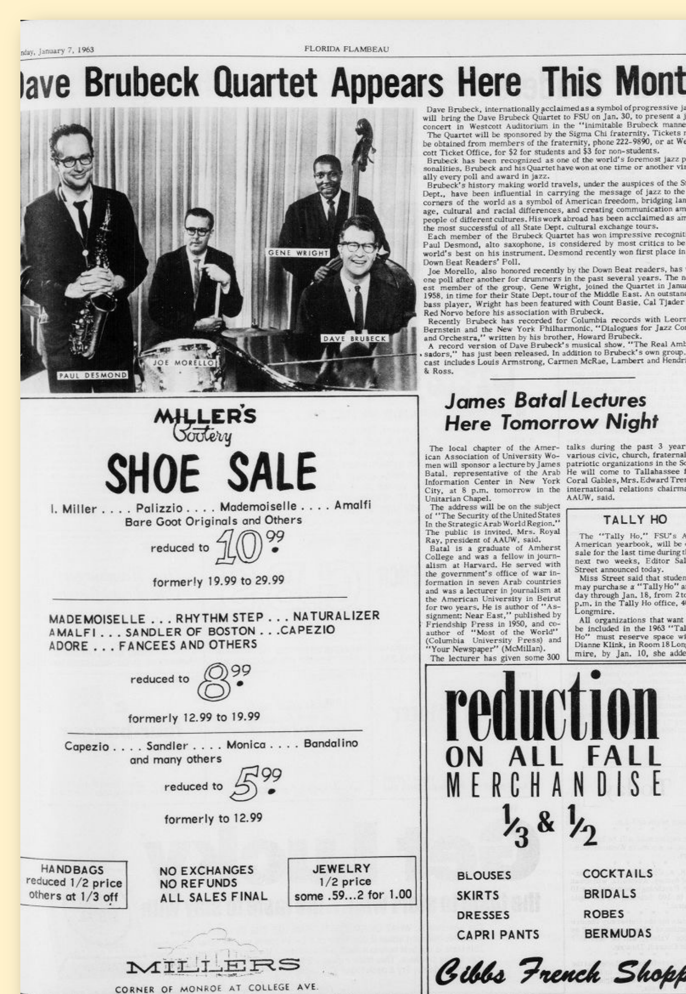
Figure 4: Page 3 of January 7, 1963's issue with relevant article 'Dave Brubeck Quartet Appears Here This Month'