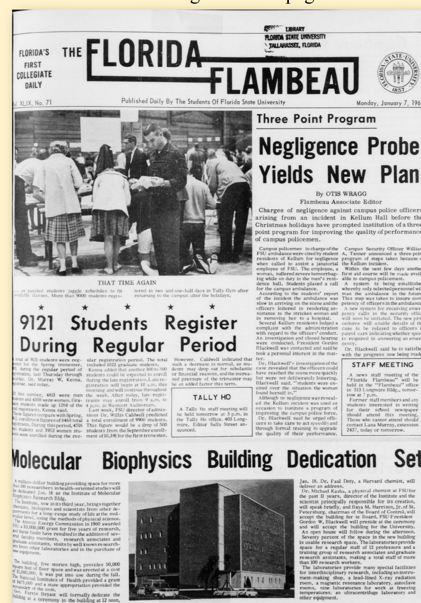
Figure 3: Front page of January 7, 1963's issue with relevant article 'Negligence Probe Yields New Plan' by Otis Wragg