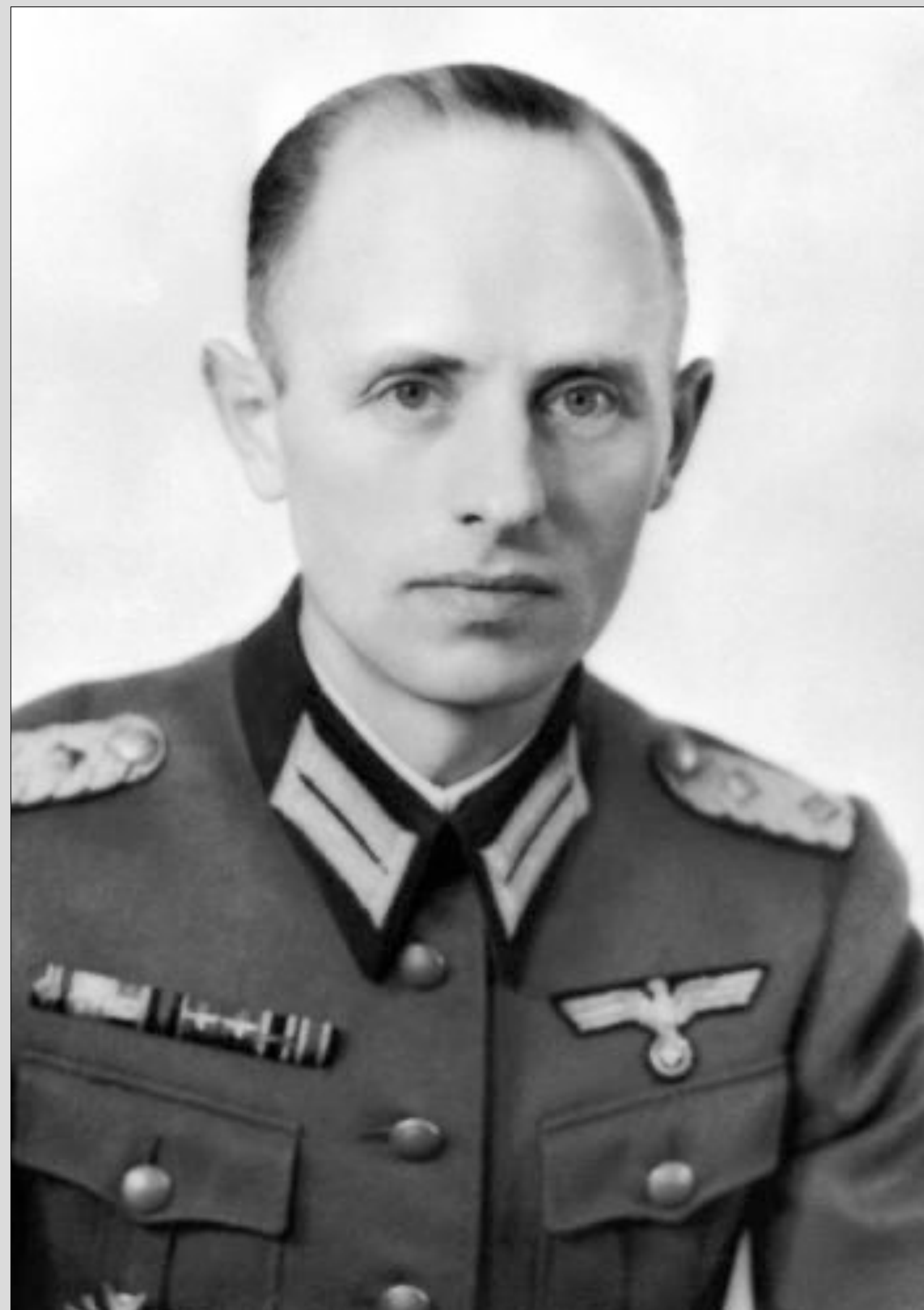
Figure 1: Reinhard Gehlen c. 1943