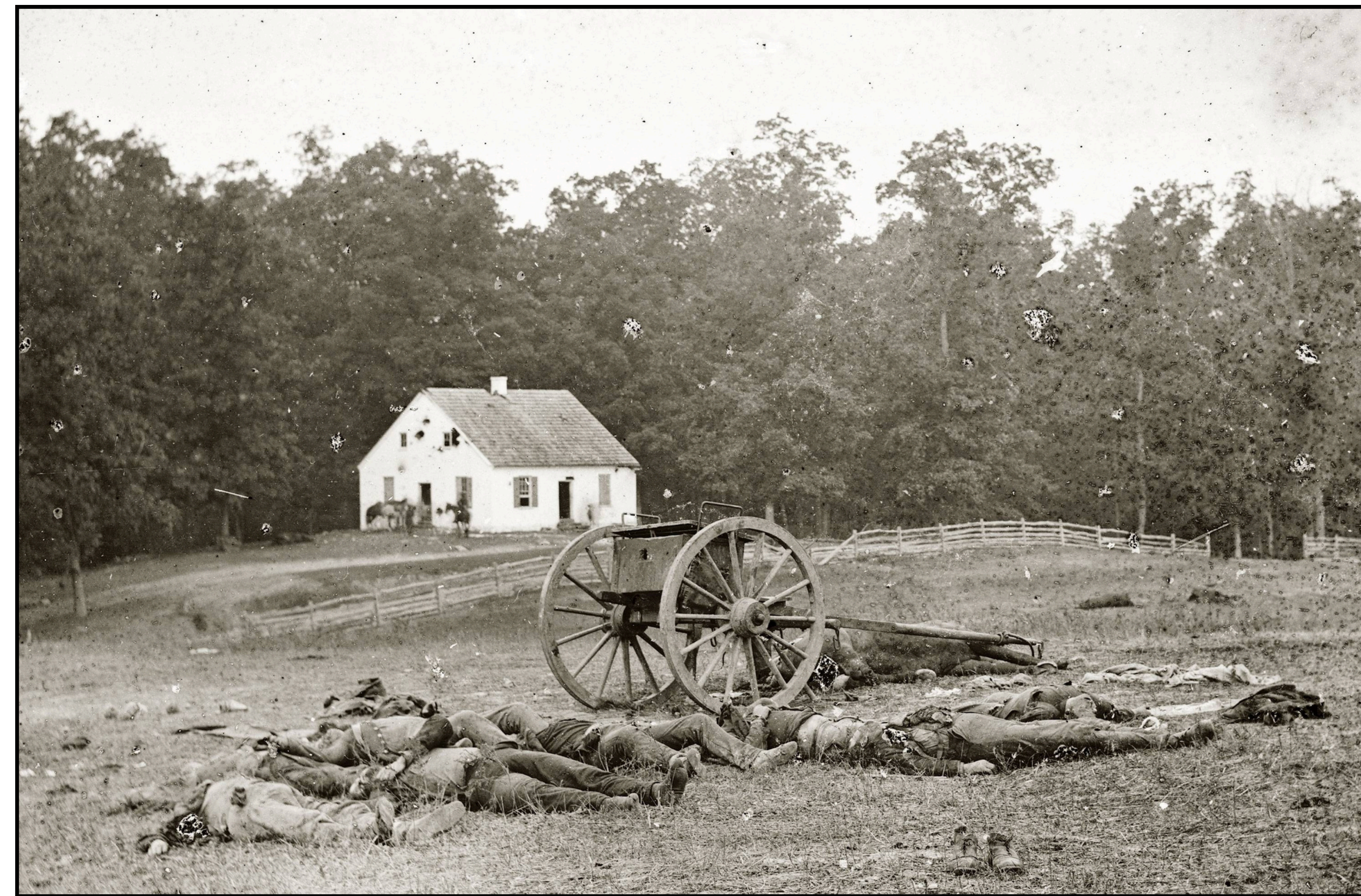
Alexander Gardner, Dunker Church