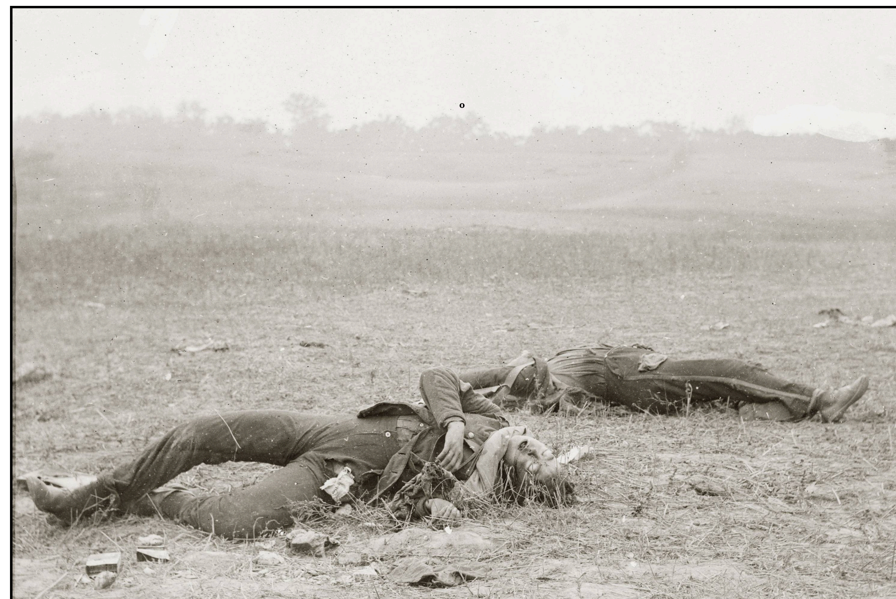
Alexander Gardner, Confederate Dead

Scan this QR code to see the bibliography compiled over the course of this project.