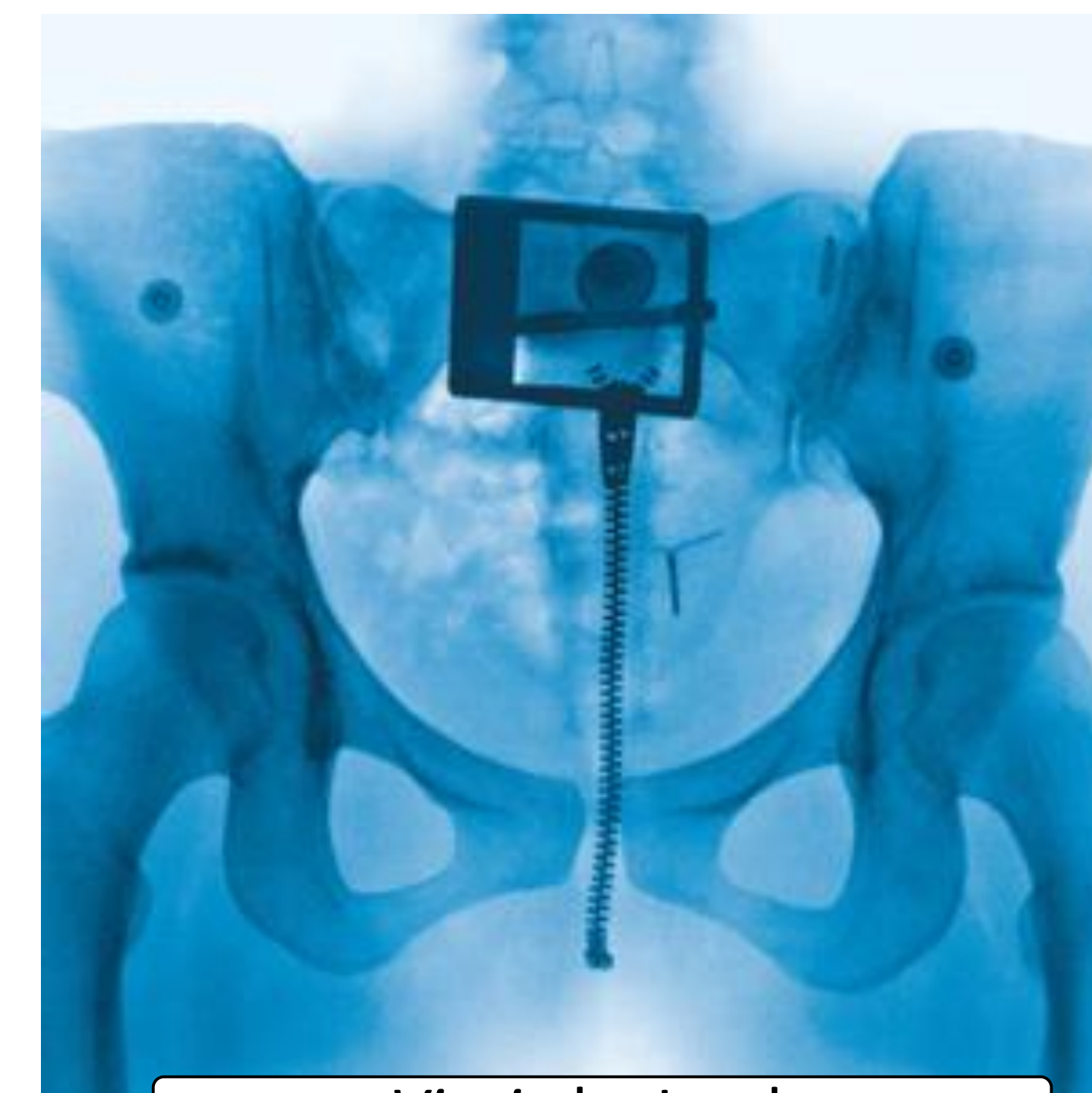
Virgin by Lorde

"Couldn't wait to turn fifteen/Then you blink and it's been ten years/Growing up a little at a time, then all at once" – "Secrets from a Girl"