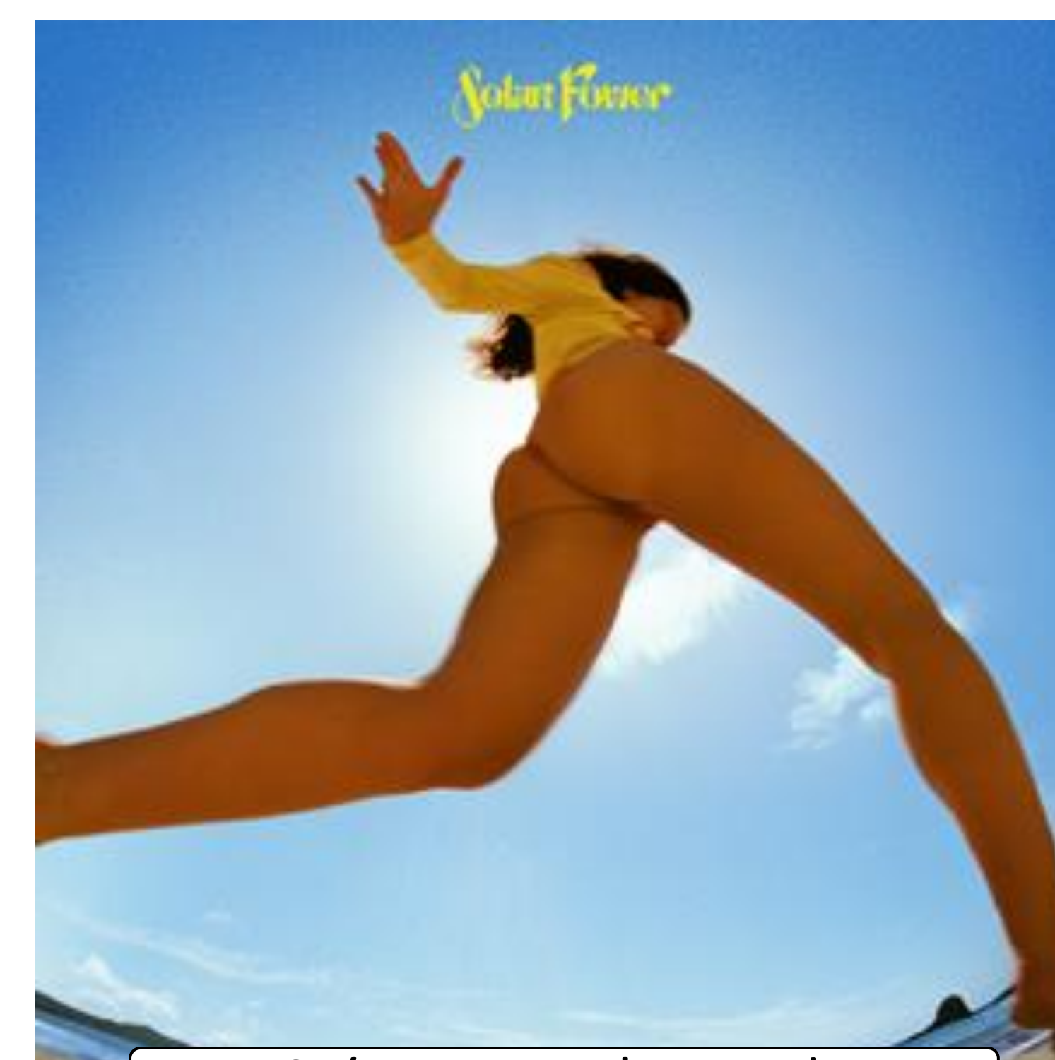
Solar Power by Lorde

"But I hear sounds in my mind/Brand new sounds in my mind"- "Green Light"