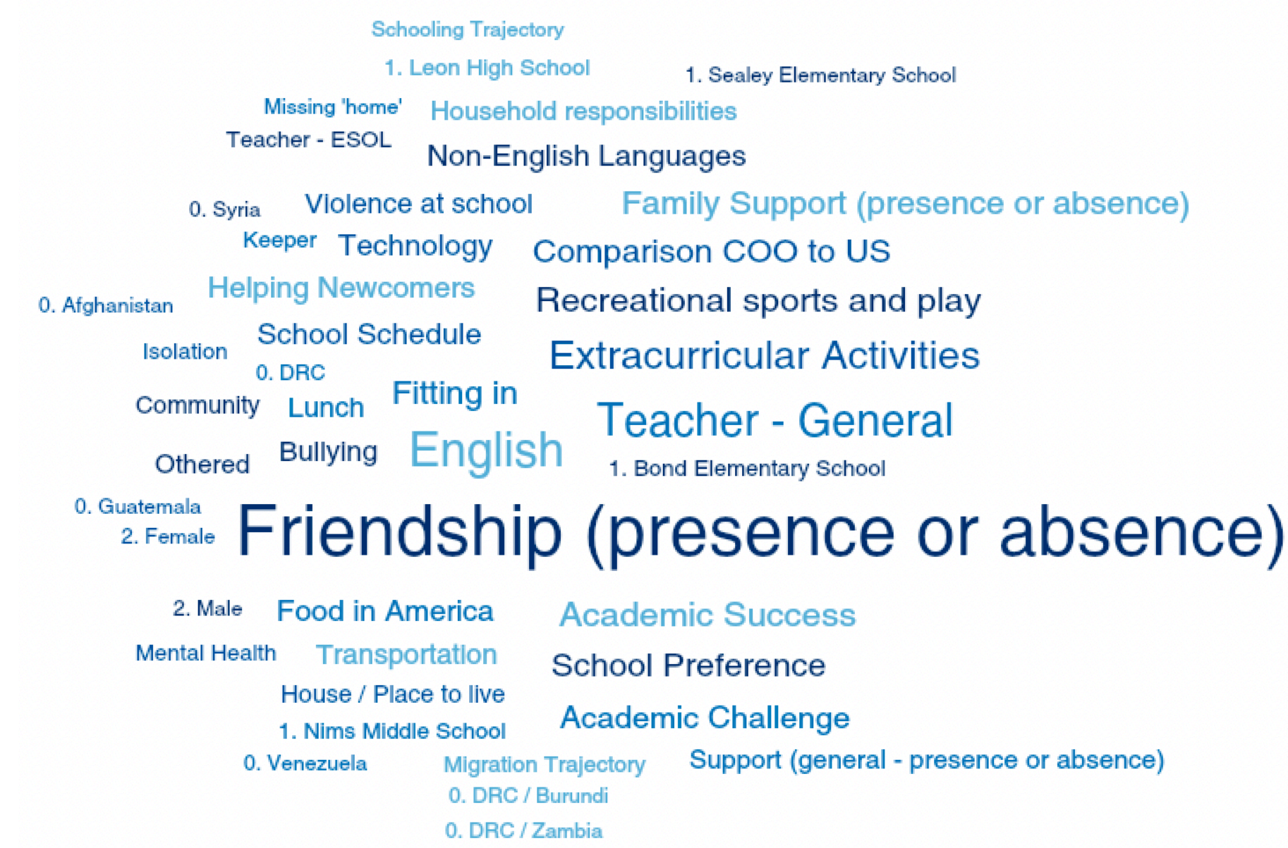
Photo shows a visual representation of the frequency of codes used.