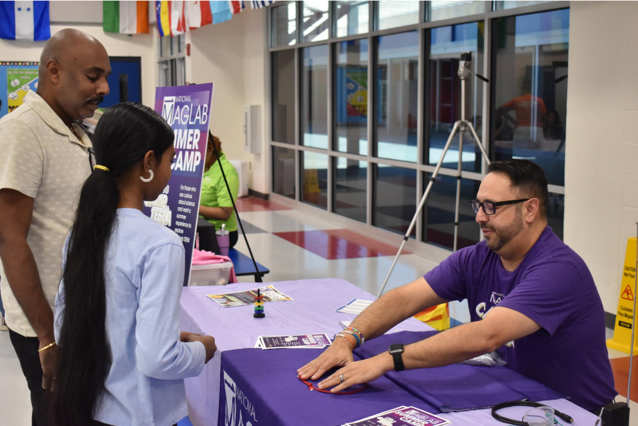
Picture 1. Participants of the Neighborhood Camp Fair.