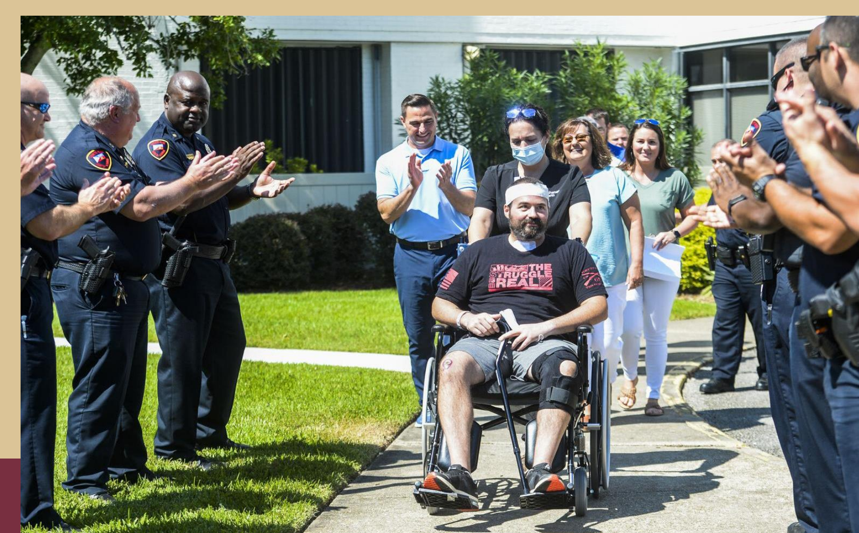
Figure 2. Lafayette officer injured on-duty cheered as he leaves hospital after a month.