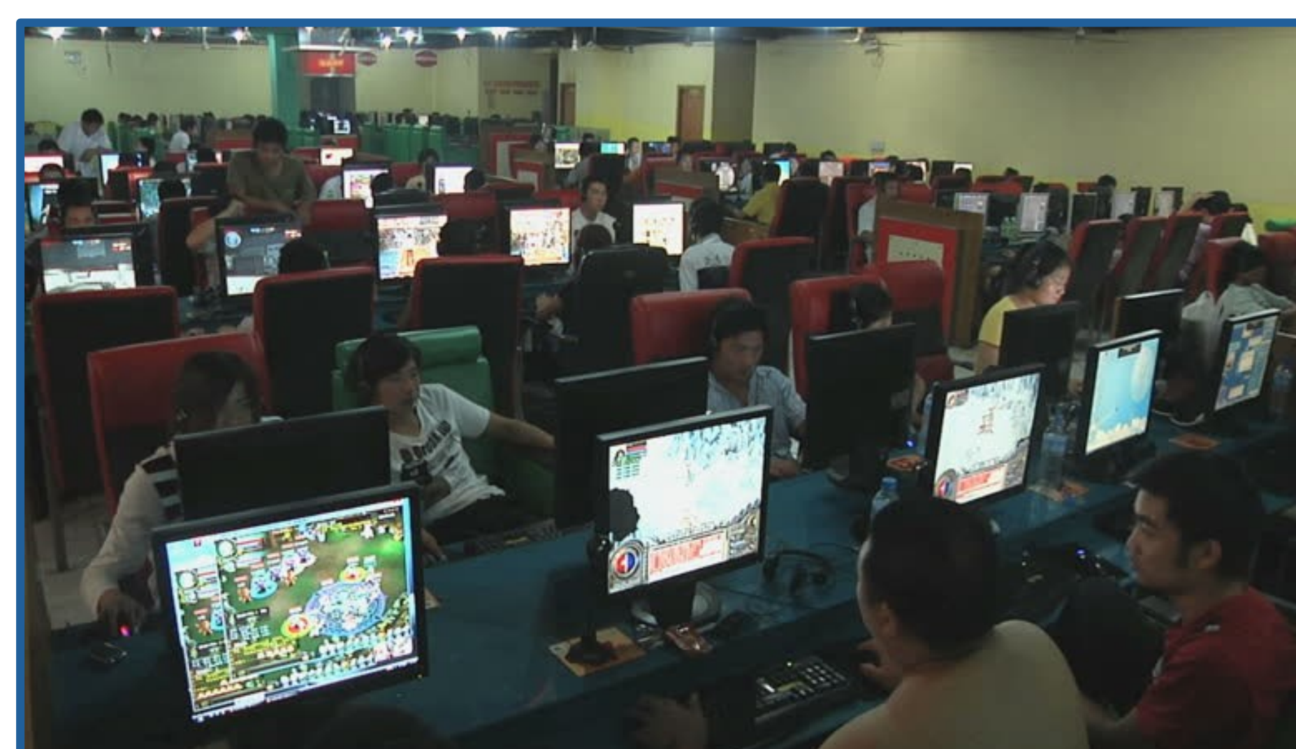
A busy internet café, where many people, especially in the early 2000's, would gather to play multiplayer games.