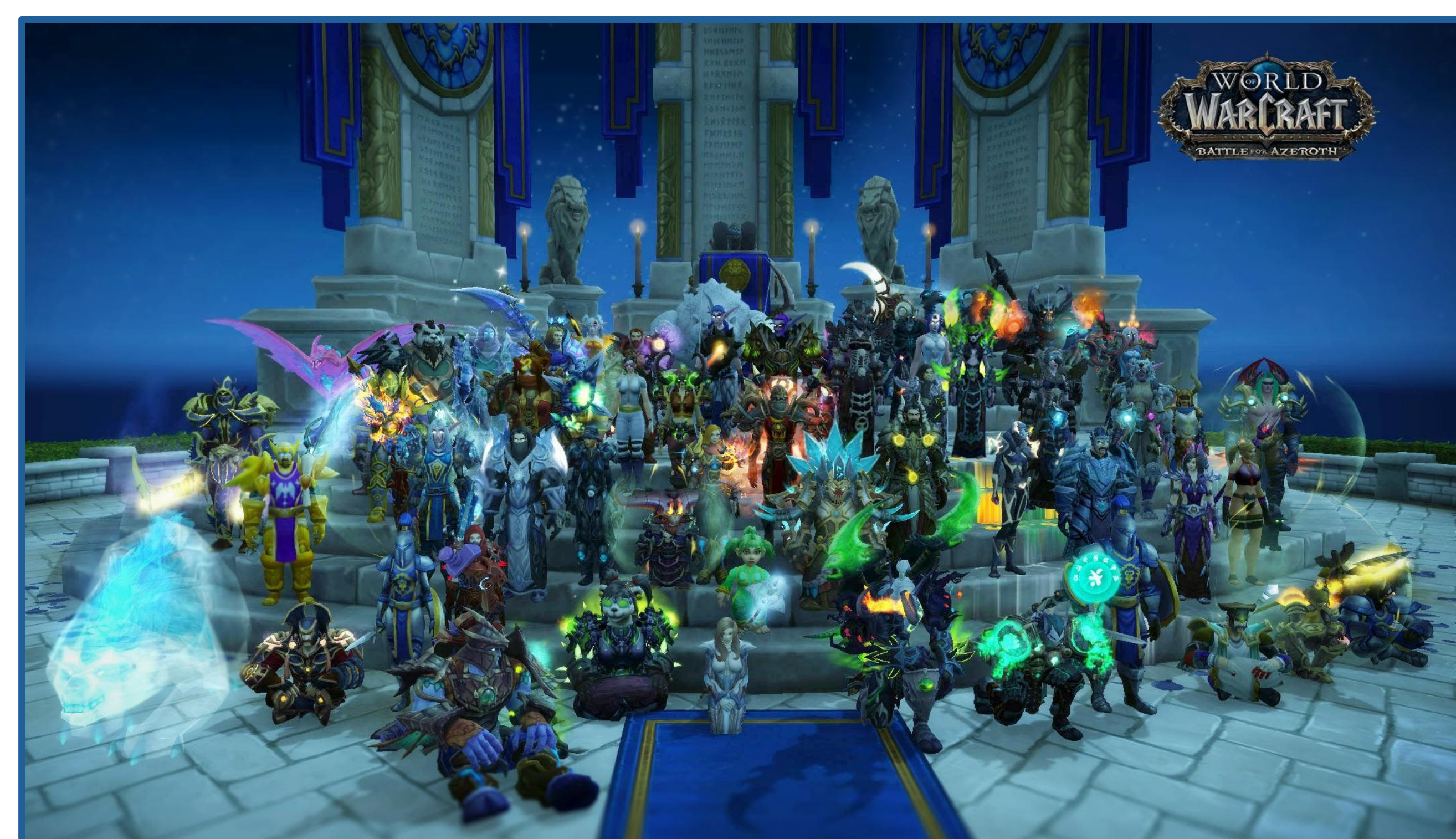
A large "Guild" of players in the game "World of Warcraft".