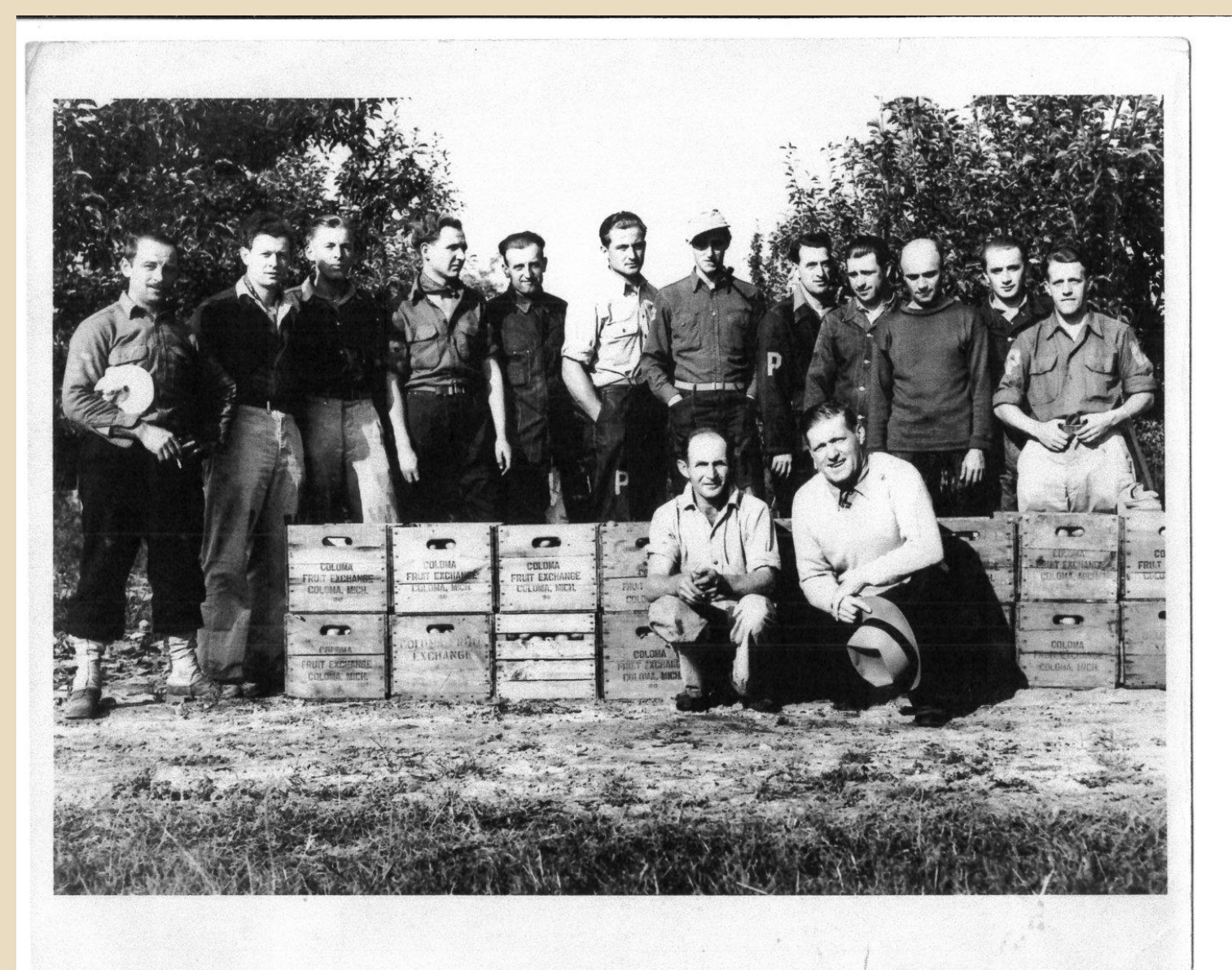
Figure 3: German POWs standing and kneeling in front of a stack of wooden crates labeled "COLOMA FRUIT EXCHANGE COLOMA, MICH." The POWs are in an outdoor setting, which captures their group activity of work, specifically fruit harvesting or packing.