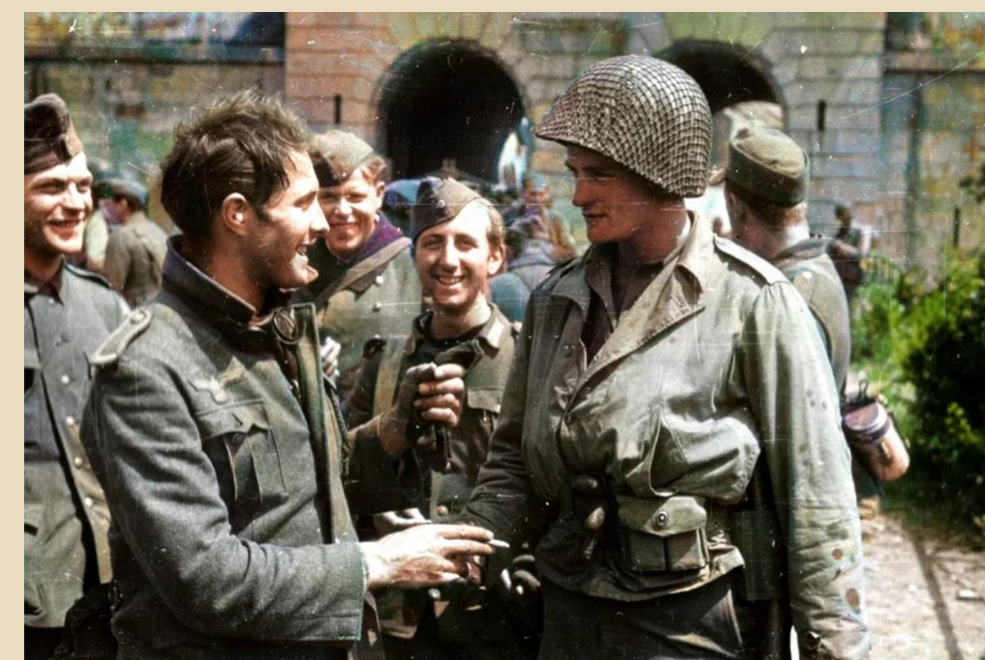
Figure 4: A scene shown that captures a moment of exchange between the soldiers during a work assignment