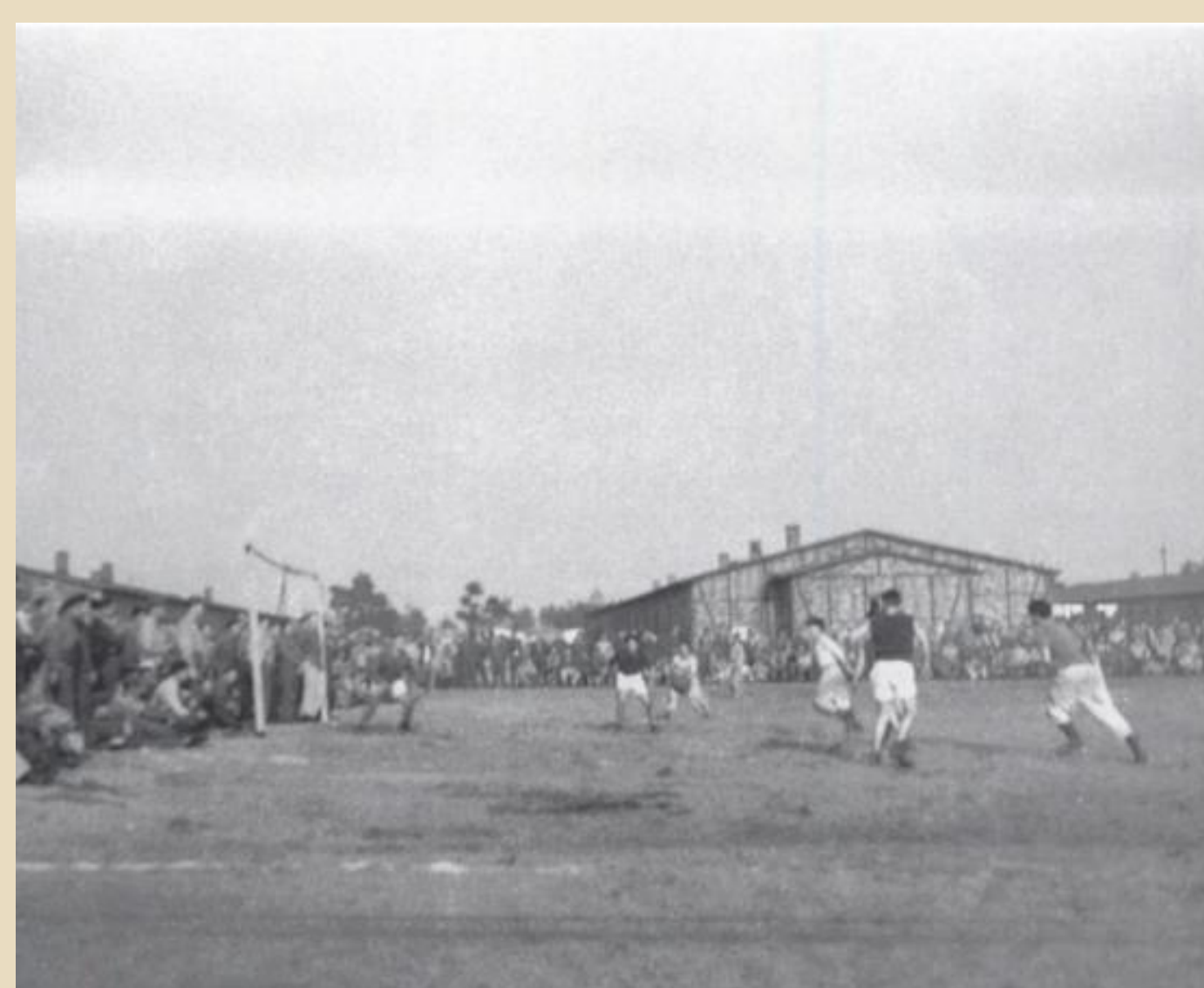
Figure 6: German prisoners participating in a soccer match in Stakagg IIB