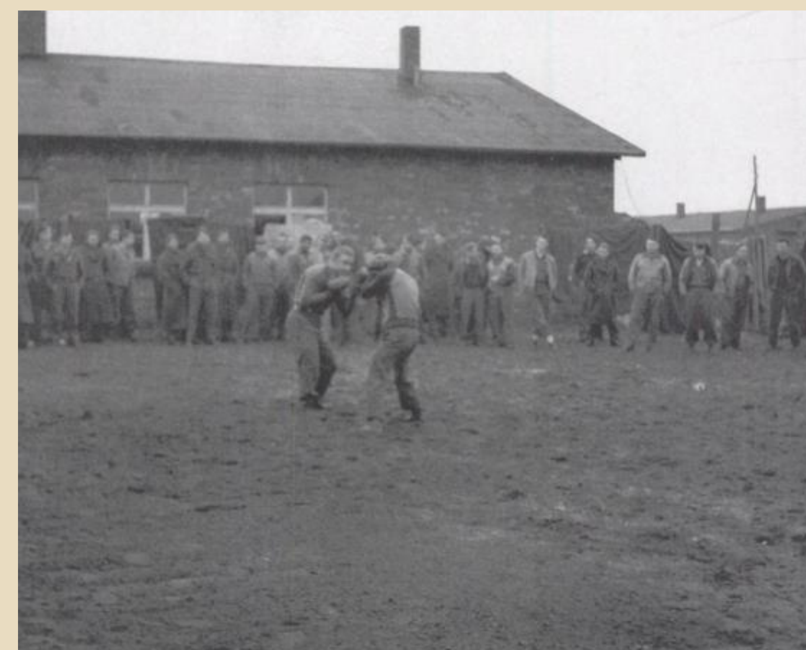
Figure 2: German prisoners standing outside in front of a building. In the center of the image, two individuals are engaged in a recreational wrestling match