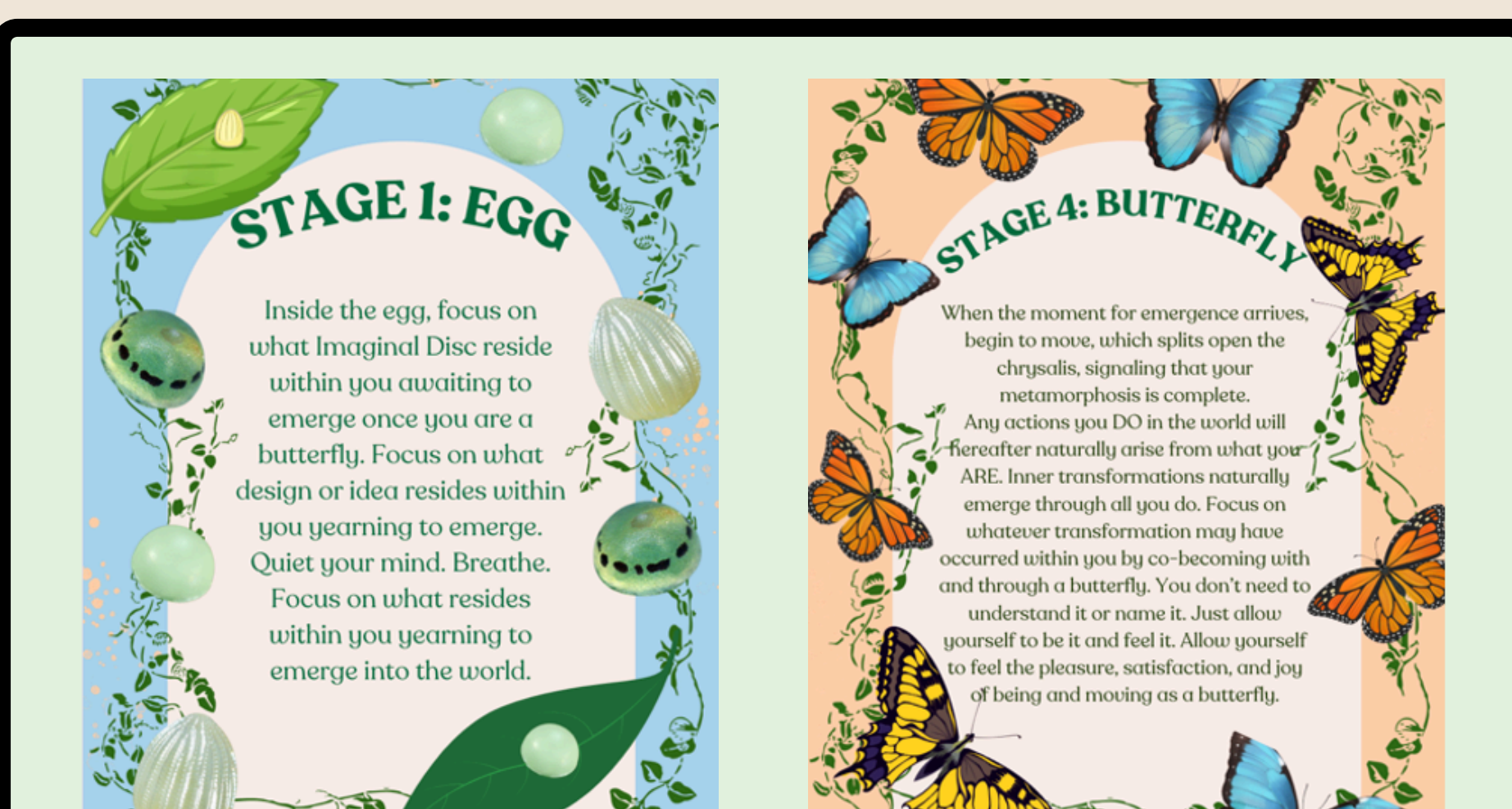
Two stages of the care deck: the egg and butterfly, which showcase what is yearning inside of us that be released to take flight.