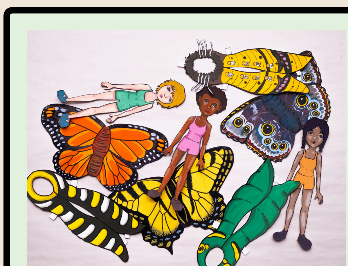
Paper dolls and accessories for each stage of a butterfly's metamorphosis.