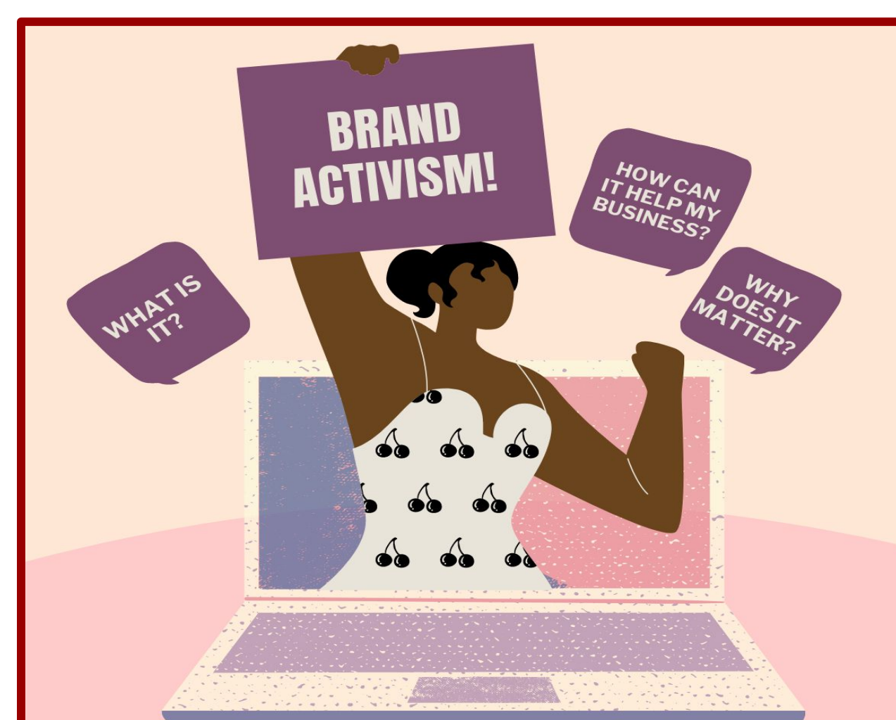
Empowering Change: Brands Taking a Stand for Social Justice