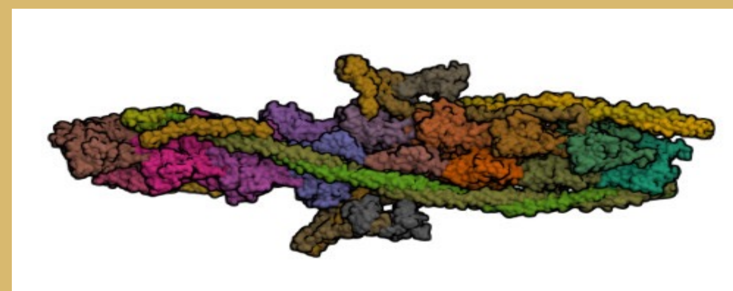
7KO4: Structure of cardiac native thin filament at pCa=5.8 having upper and lower troponins in Ca 2+ free state

The goal of this project is to bring awareness to the benefits of visual model usage in educational settings as well as for future research purposes through the use of 3D printing.