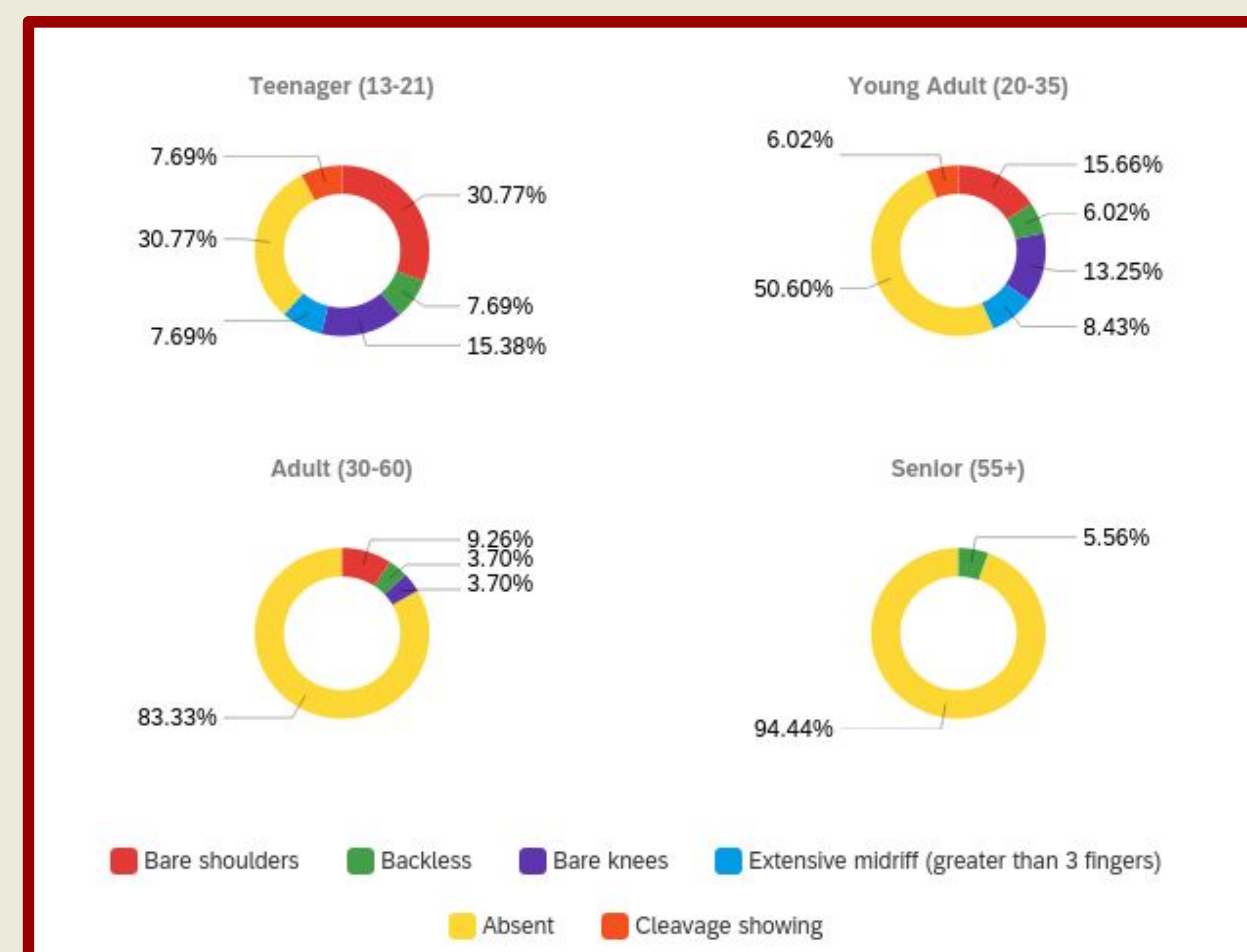
Figure 2. Presentation of Bare Skin according to Age