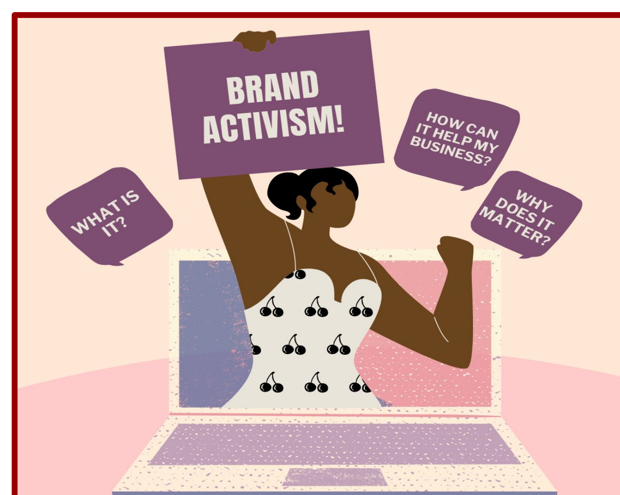
Empowering Change: Brands Taking a Stand for Social Justice