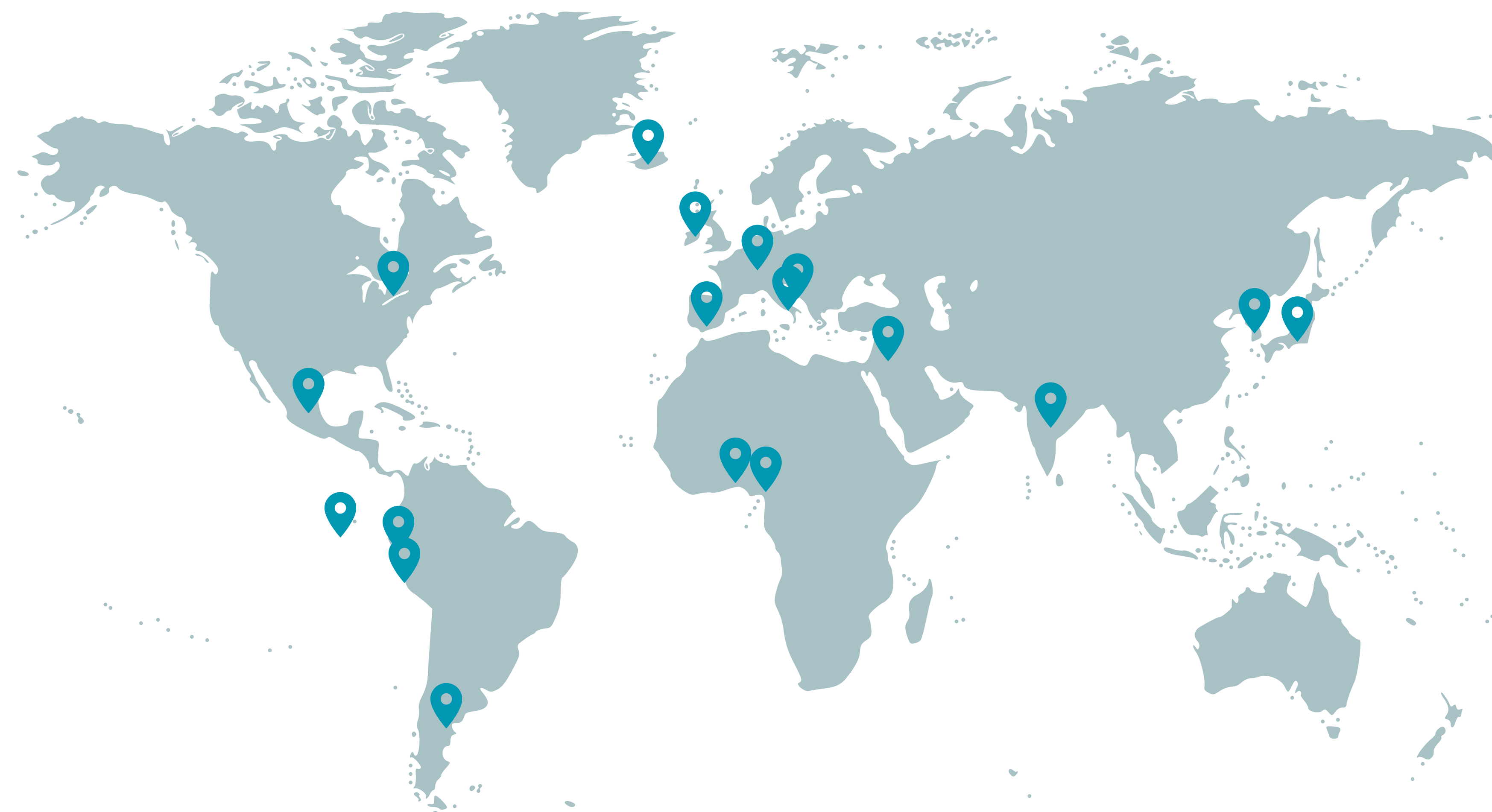
In the 2022-24 funding cycle, seven institutions funded a total of 37 Tyler Fellows' travel to 17 countries: Argentina, Canada, Côte d'Ivoire, Ecuador (and Galápagos Islands), Germany, Iceland, India, Ireland, Italy, Japan, Jordan, Mexico, Nigeria, Peru, Romania, Spain, and South Korea.