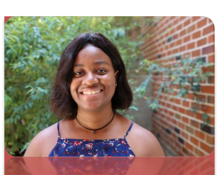
Class of 2019 Major: Political Science and History