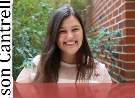
Class of 2019 Major: International Affairs and Economics Minor: Law in Philosophy

Research Project: I currently conduct research on International Economics.