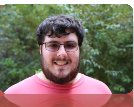
Class of 2020 Major : Political Science and Spanish