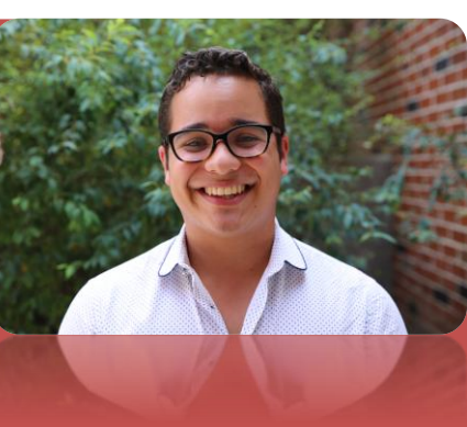
Class of 2020 Major: History and Classics