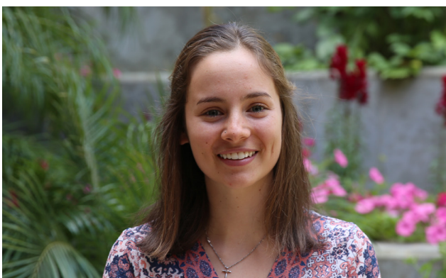
Phi Eta Sigma Undergraduate Research Award