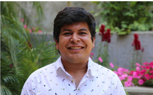
Steve Madden Undergraduate Research Award