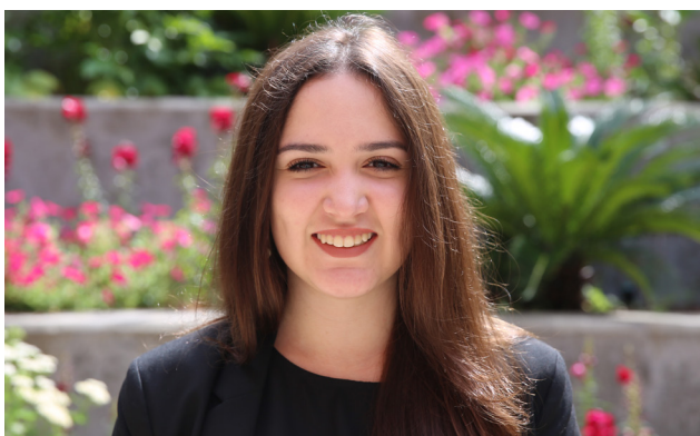
Steve Madden Undergraduate Research Award