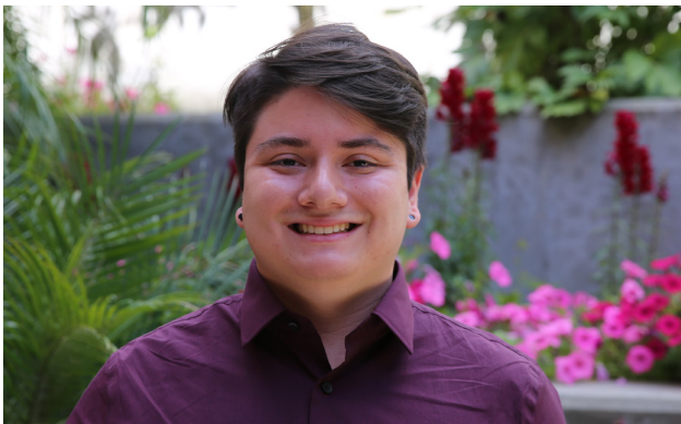
Scott & Ina McNichols Undergraduate Research Award