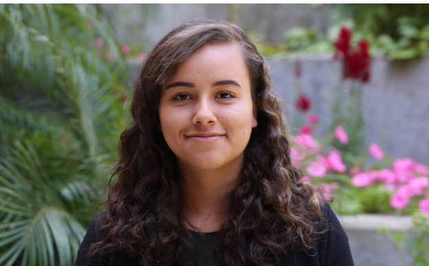
Garnet and Gold Scholar Society IDEA Grant