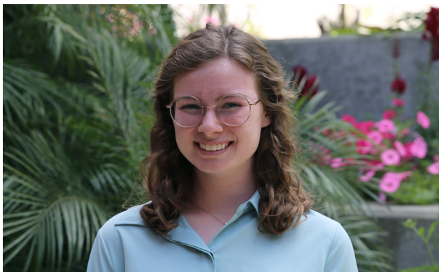
Dr. Jack Saltiel Undergraduate Research Award