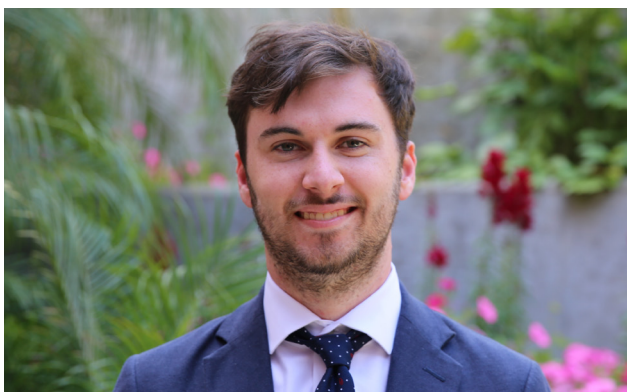
Robert and Mary Frappier Undergraduate Research Award