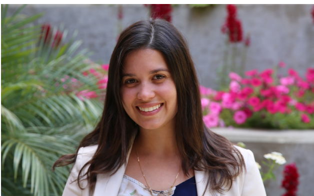
Phi Eta Sigma Undergraduate Research Award