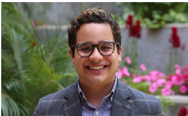
Garnet and Gold Scholar Society IDEA Grant