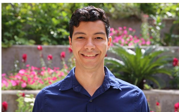
Steve Madden Undergraduate Research Award