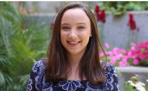
Scott & Ina McNichols Undergraduate Research Award