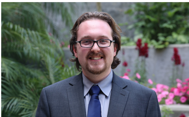
David B. Ford Undergraduate Research and Creativity Award