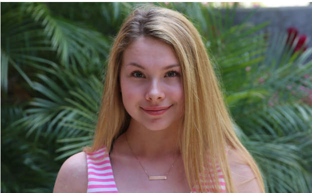
Scott & Ina McNichols Undergraduate Research Award