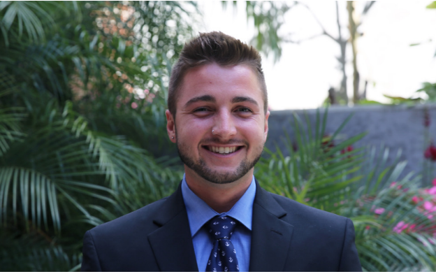
Phi Eta Sigma Undergraduate Research Award