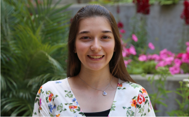
Steve Madden Undergraduate Research Award