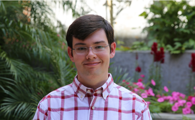
Scott & Ina McNichols Undergraduate Research Award