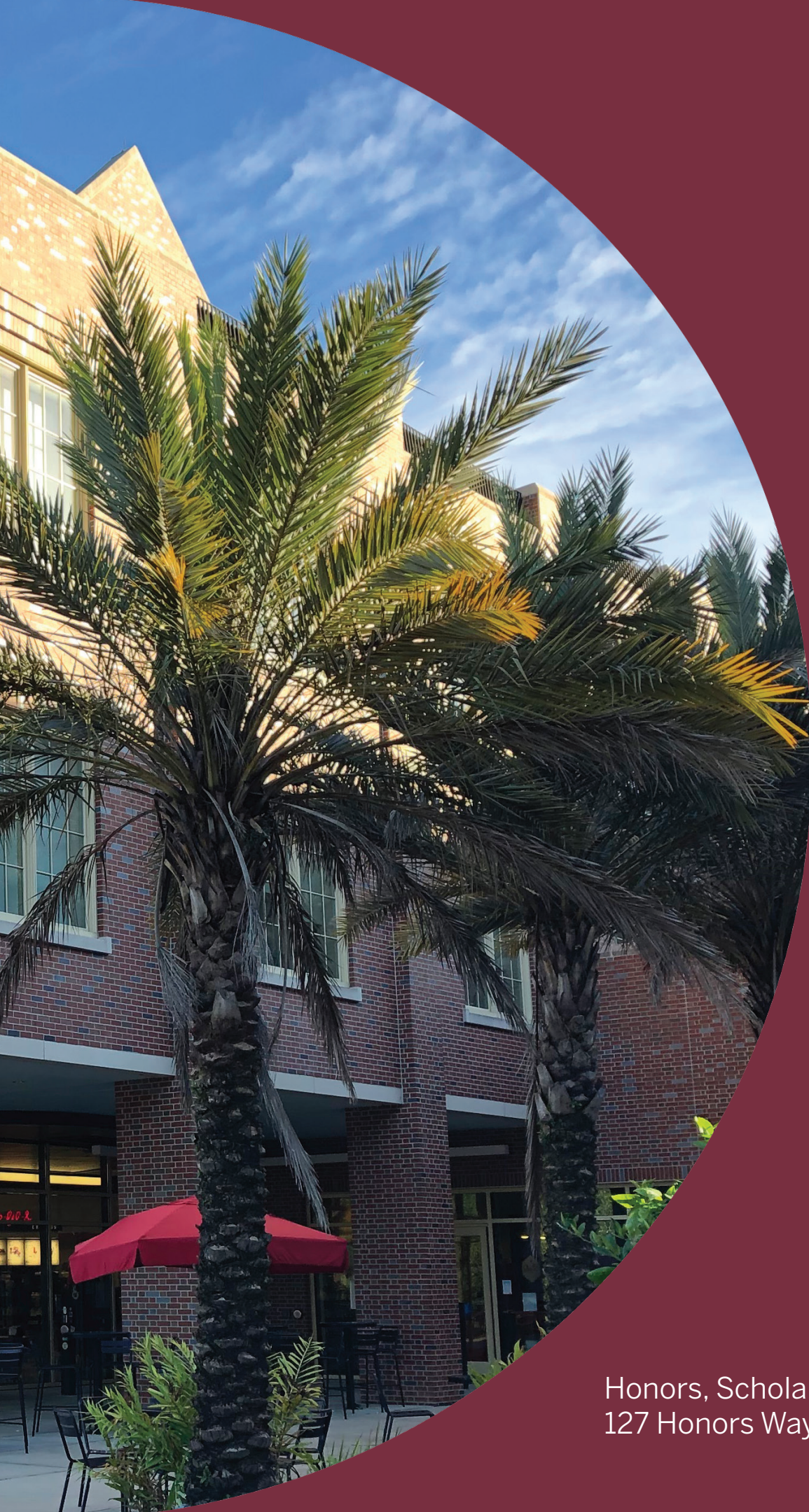
Honors, Scholars, and Fellows House 127 Honors Way