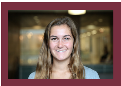
Class of 2020 Major: Criminology and Psychology

Current Research Focus: Not currently engaging in research, but I am interested in anything pertaining to the criminal justice system.