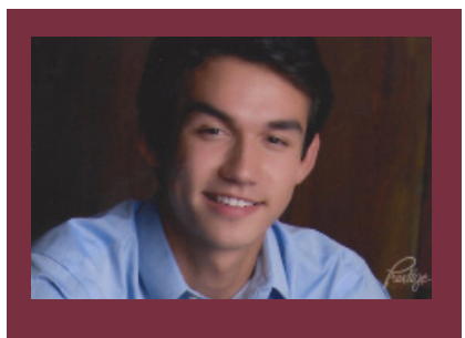
Class of 2021 Major: Computational Science

Current Research Focus: My current research focus is in computer science applications to biology. I am working on using computer assisted geomorphic analysis to investigate new species of snakes in Brazil.