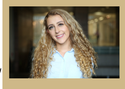
Class of 2021 Major: Biochemistry

Current Research Focus: I just started working in a lab at the college of medicine regarding basic cancer research.