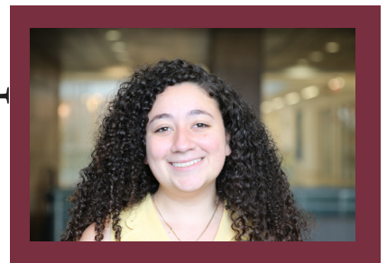
Class of 2020 Major: Environmental Science and Creative Writing