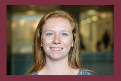
Class of 2020 Major: Exercise Physiology

Current Research Focus: Sports Psychology