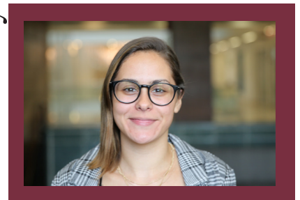
Class of 2020 Major: Biology

Current Research Focus: I have previous research experience with the FSU college of Exercise Science studying the effects of good nutrition on patients with Diabetic foot ulcers. I have also spent a summer studying a new Medtronic Insulin Pump that has an automatic regulating system in children under 12 years old at the University of South Florida.