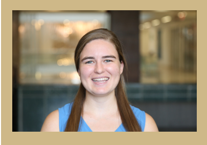
Class of 2020 Major: International Affairs

Please email me with any questions you have about UROP or my research!: mpl16e@my.fsu.edu