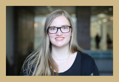
Class of 2021 Major: Psychology

Current Research Focus: My current research focuses on peoples' personal qualities that affect their romantic relationships.